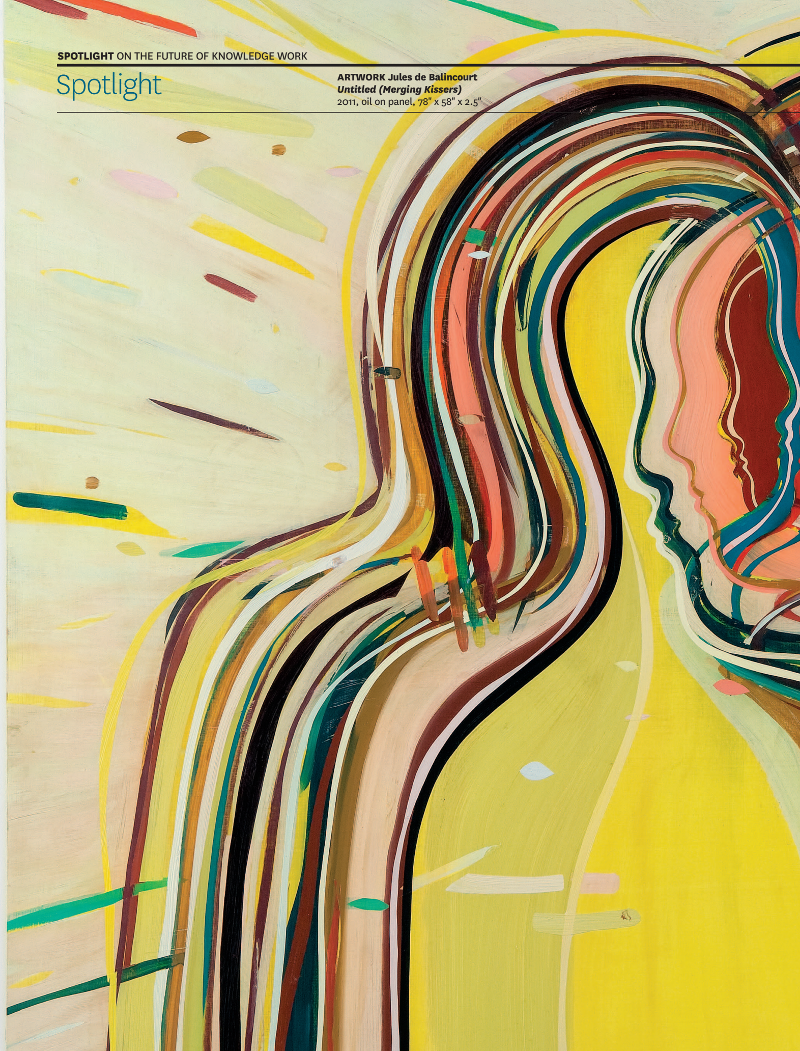
ARTWORK Jules de Balincourt Untitled (Merging Kissers) 2011, oil on panel, 78" x 58" x 2.5"